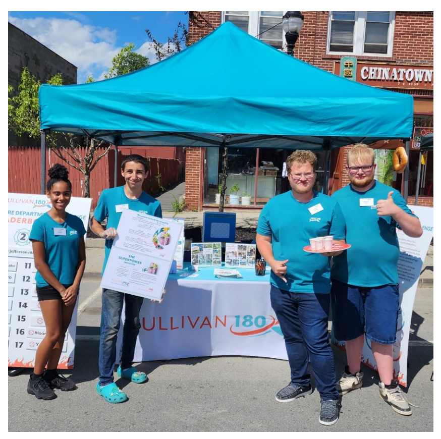
Sullivan 180 Interns supporting outreach efforts at the 2023 Bagel Festival.