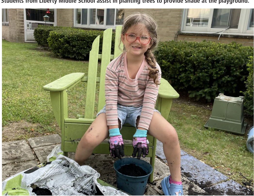
Monticello's Emma Chase School Student gets their hands dirty prepping plants for their Catskill Edible Garden Project.