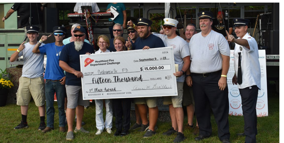
Grahamsville Fire Department celebrates their first place win of the Healthiest Fire Department