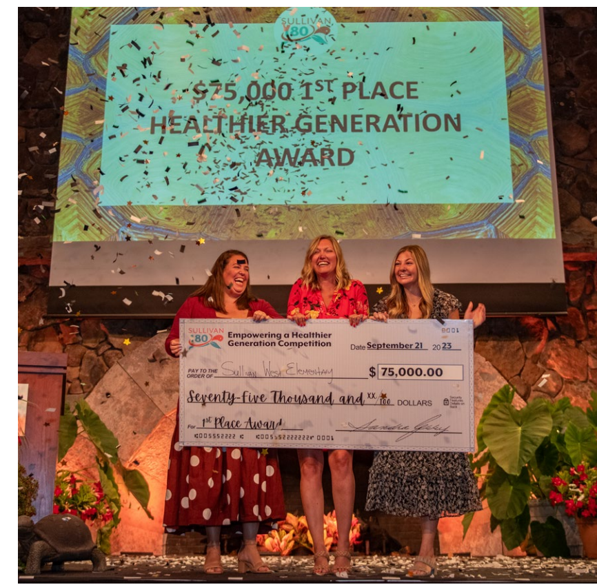
Sullivan West Elementary School, winners of the 1st Place Competition Award in the amount of $75,000, at the Empowering a Healthier Generation Celebration