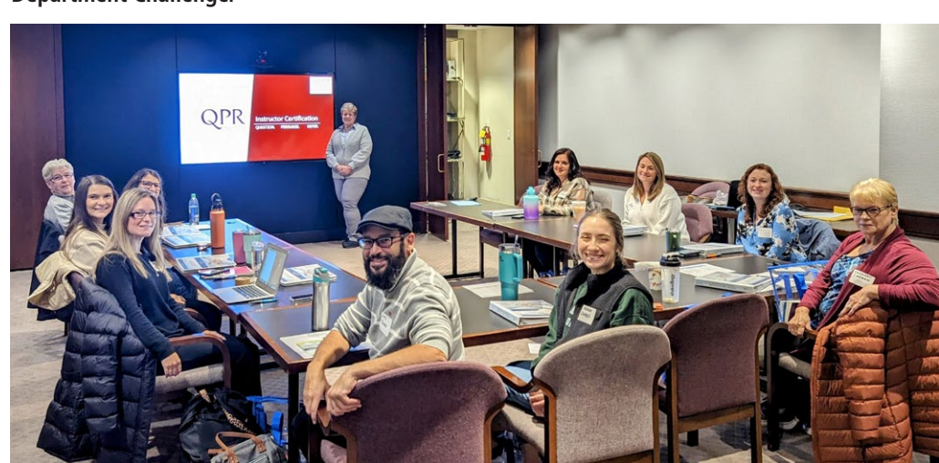
QPR (Question, Persuade, Refer) Suicide Prevention Gatekeepers training of school counselors, school social workers, school nurses, and members from community organizations.