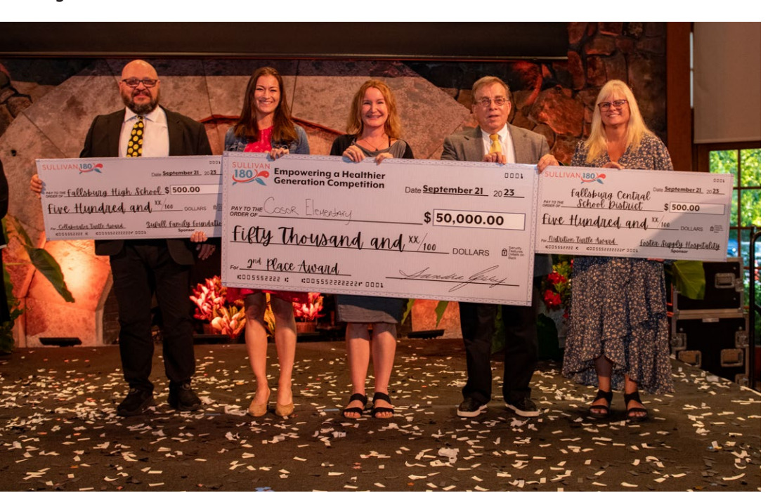
Fallsburg's Benjamin Cosor Elementary School, winners of the 2nd Place Competition award in the