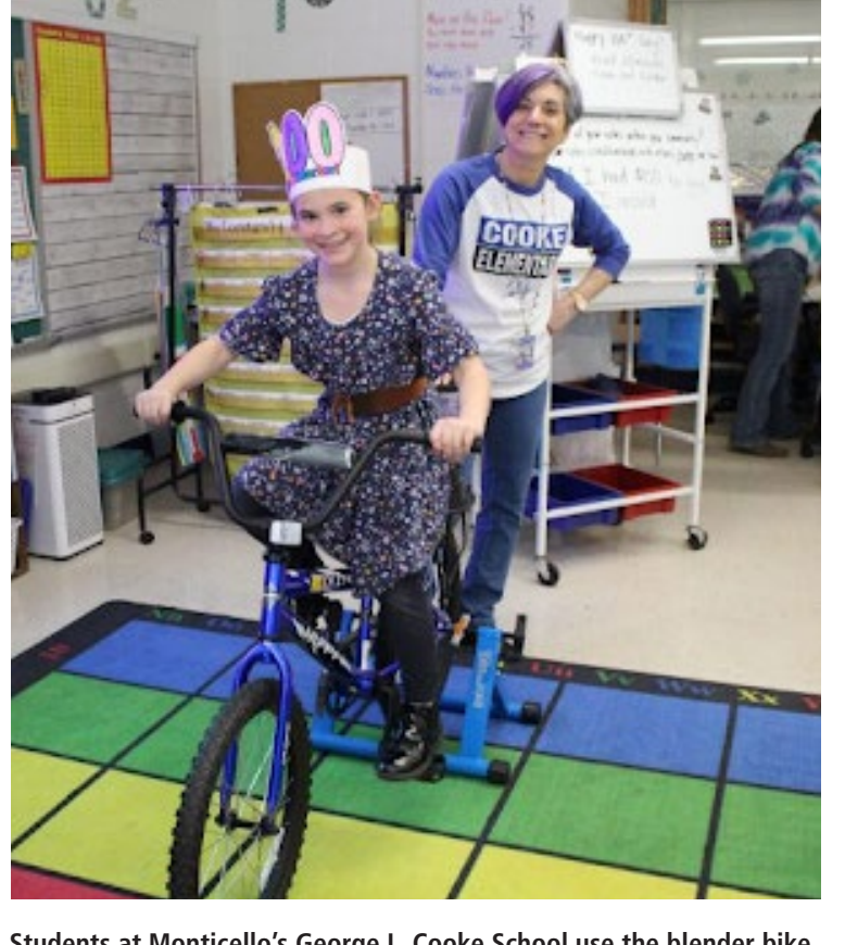
Students at Monticello's George L. Cooke School use the blender bike for healthy celebrations in the classroom.