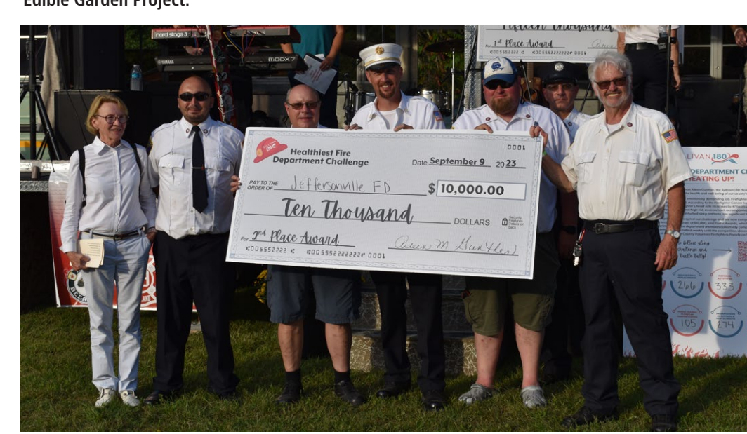
Jeffersonville Fire Department celebrates coming in second place in the Healthiest Fire