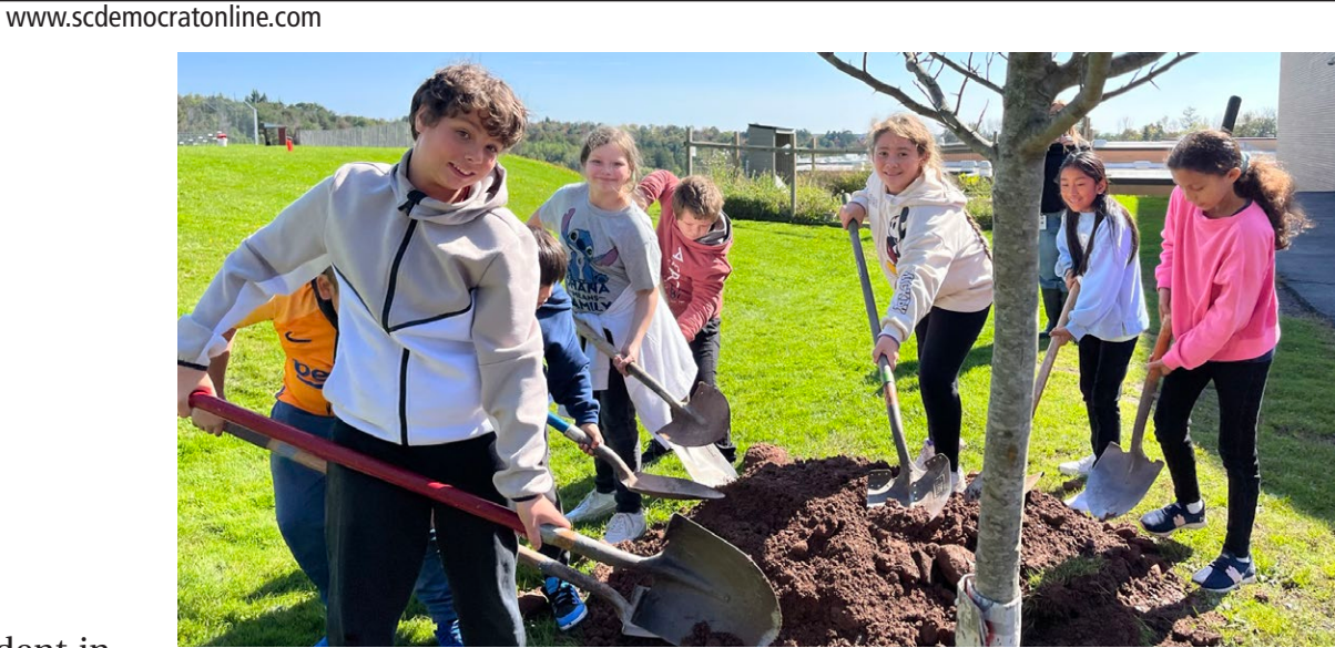
Students from Liberty Middle School assist in planting trees to provide shade at the playground